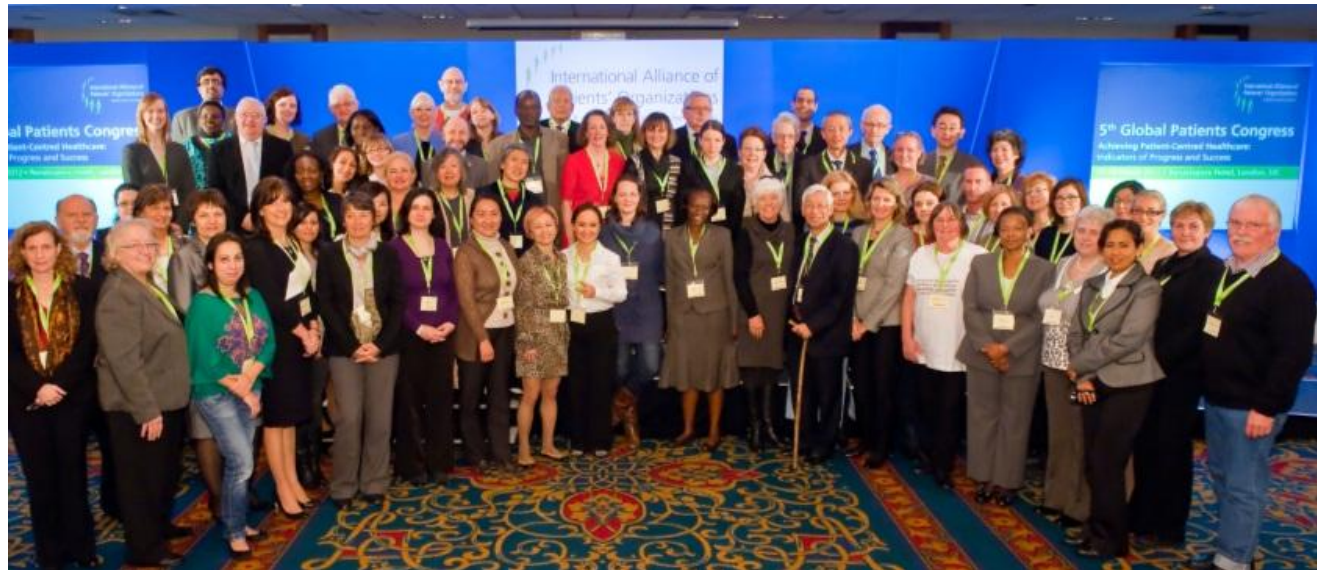
IAPO Members at the 5 th Global Patients Congress, London, 2012